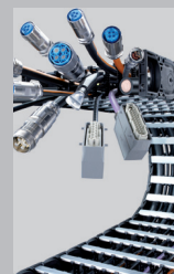
TOTALTRAX complete systems