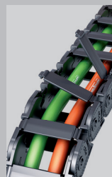
Plastic cable carrier systems