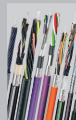
Cables in motion

TSUBAKIMOTO EUROPE B.V. AVENTURIJN 1200 3316 LB DORDRECHT THE NETHERLANDS TEL: +31 (0)78 620 4000 FAX: +31 (0)78 620 4001 E-MAIL: INFO@TSUBAKI.EU INTERNET: HTTP://TSUBAKI.EU