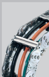
Steel cable carrier systems

For more information, please visit: kabelschlepp.de